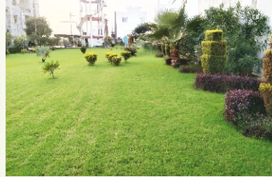
ACTUAL PARK IMAGE