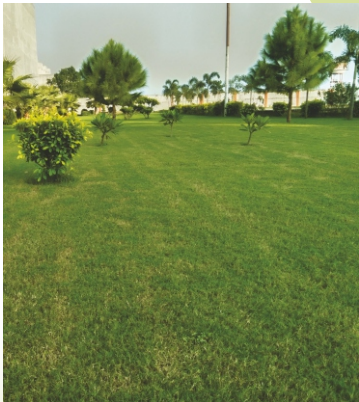
ACTUAL PARK IMAGE