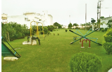
ACTUAL PARK IMAGE